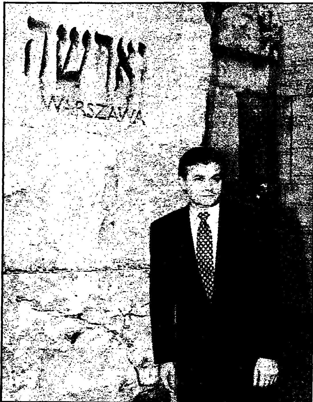
Polish Prime Minister Włodzimierz Cimoszewicz visits the Warsaw section in the Valley of Communities at Yad Vashem yesterday.

Poland's parliament, the Sejm, will wind up discussions in two committees next week on a bill for restitution for Jewish properties seized during the Holocaust.